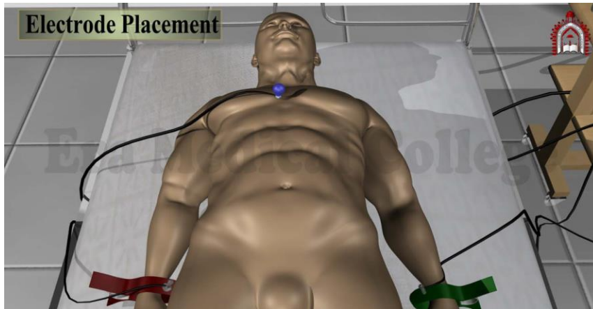
Fig. 1: Snap shot depicting site of electrode placement