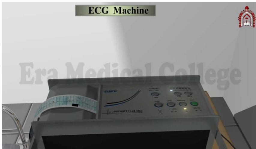
Fig. 2: Traditional ECG machine