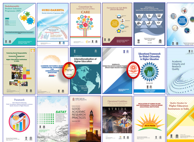
Fig. 1: UGC and NEP

time, all the universities and higher education institutions, follow the same pattern, and align with this. More than 18 books (Figure 1) have been published in the public domain on the UGC website for use, and all these guideline documents are in alignment with the national education policy. Each of the key areas of reform in NEP has got a respective guideline document in the UGC. 2 The guidelines publishing commenced by the UGC from 2019 onwards well ahead of the draft implementation. Following the release of NEP 2020, the frequency of notification and circulars from UGC to educational institutions have raised several folds, which demands a dedicated workforce on the institution side to read all the relevant documents and provide recommendations for proper governance.