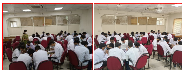
Figure 1: First picture is showing EG discussion and second picture is showing HG discussion

They were explained that once they learn the sub topic assigned to them in EG they will be rearranged as to make the Home Group (HG), where at least one representative from each EG will join to make the team having members from each EG. They were asked to refer the didactic lecture class notes, e-books which they carry in their mobile, textbook etc and discuss the sub topic in their EG. Fifteen minutes time was allotted to them to discuss their respective sub topic in their respective EG. Once the discussion in EG was complete, these students were reorganised in the HG in next 5 minutes.