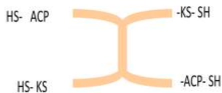
Short hand model of MEC- FAS